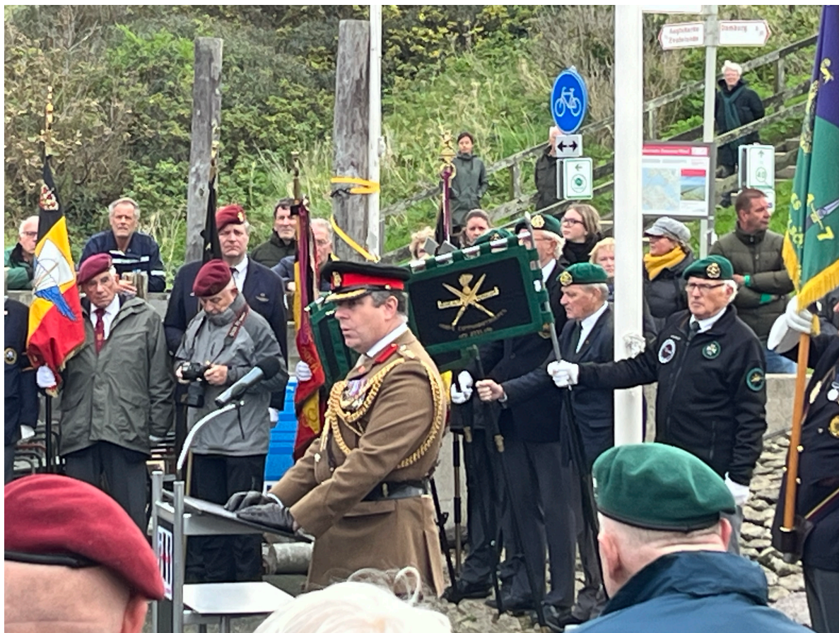
Above: The scene at the Polderhuis Museum as Colonel Piers Strudwick UK Defence Attache spoke to the crowd in Westkapelle.

German forces, well aware of the strategic significance of Walcheren, had turned the island into a formidable defensive stronghold. The battle began with a massive amphibious assault, with British and Canadian forces, supported by naval and aerial bombardments, attempting to overcome the entrenched German defences.