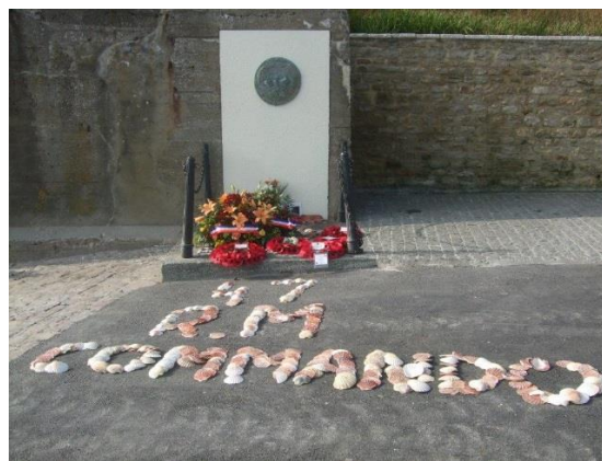
Vive le Commando!